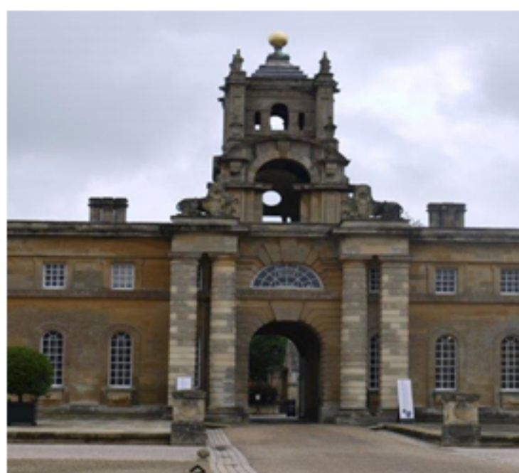
Blenheim Palace, home of the 12th Duke of Marlborough

Carrying on was easy. This was a field trip, "not for novices". The itinerary was as rigorous as boot camp, but the passion for what we do (and of course, daily tea at 4 PM) fueled any mid-afternoon slump. Designers, as you may know, are a hearty bunch - our stamina being condition by years of walking the design markets, and arranging furniture and accessories (did we say move that sofa again?) Like a brigade on a mission, we faced each day's schedule head on without as much as a complaint of jet lag or visual overload from any member of our group.