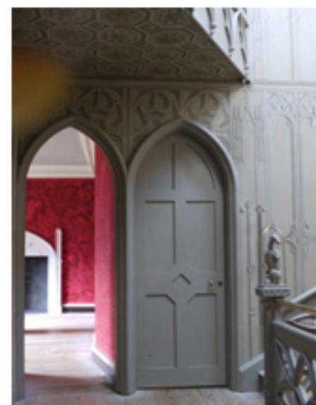
Doorway, Strawberry Hill