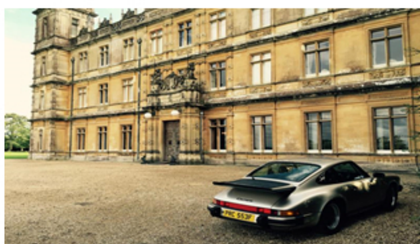
The 8th Earl of Carnarvon arrives home at Highclere Castle