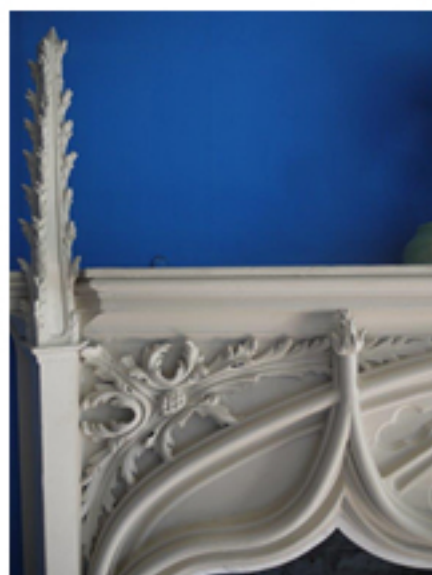
Strawberry Hill, Horace Walpole's Gothic Castle